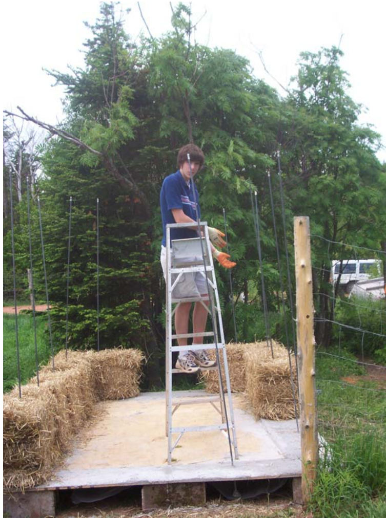
Fixing rods, a ladder and gloves is all it takes to construct the straw walls.