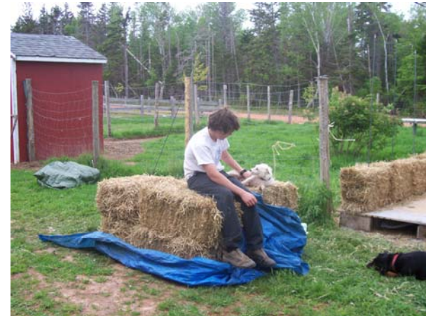
Hard work calls for a break.