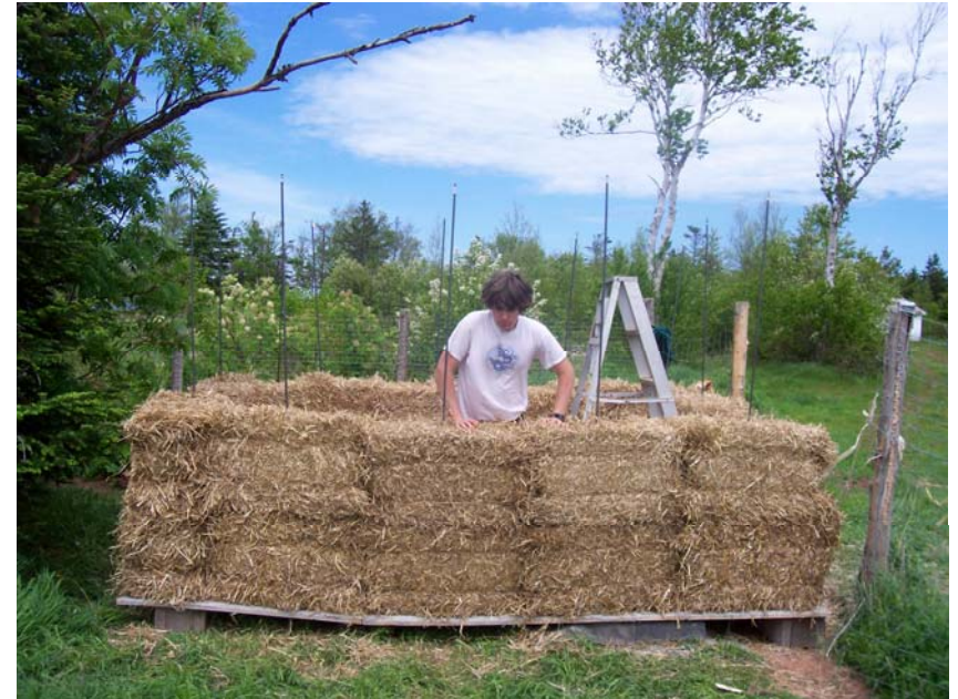
Half of the bales already piled up to neat scoop walls.